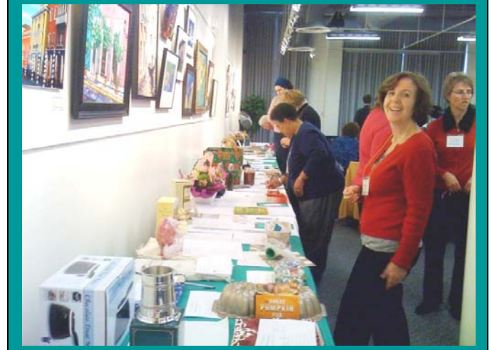
A good time was had by all at our Holiday Tea Fundraiser.