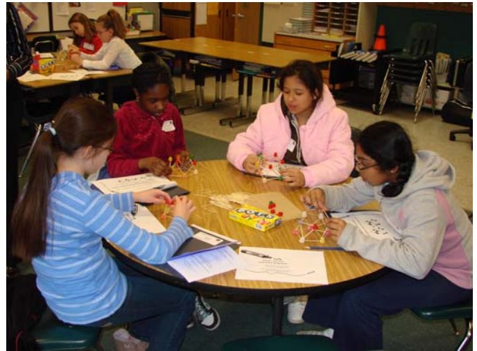
Students participating in a 2009 GEMS workshop.

enter middle school and beyond. We are again looking forward to joining Dogwood School and Lockheed Martin (the school's corporate sponsor) in making this year's Conference another big success.