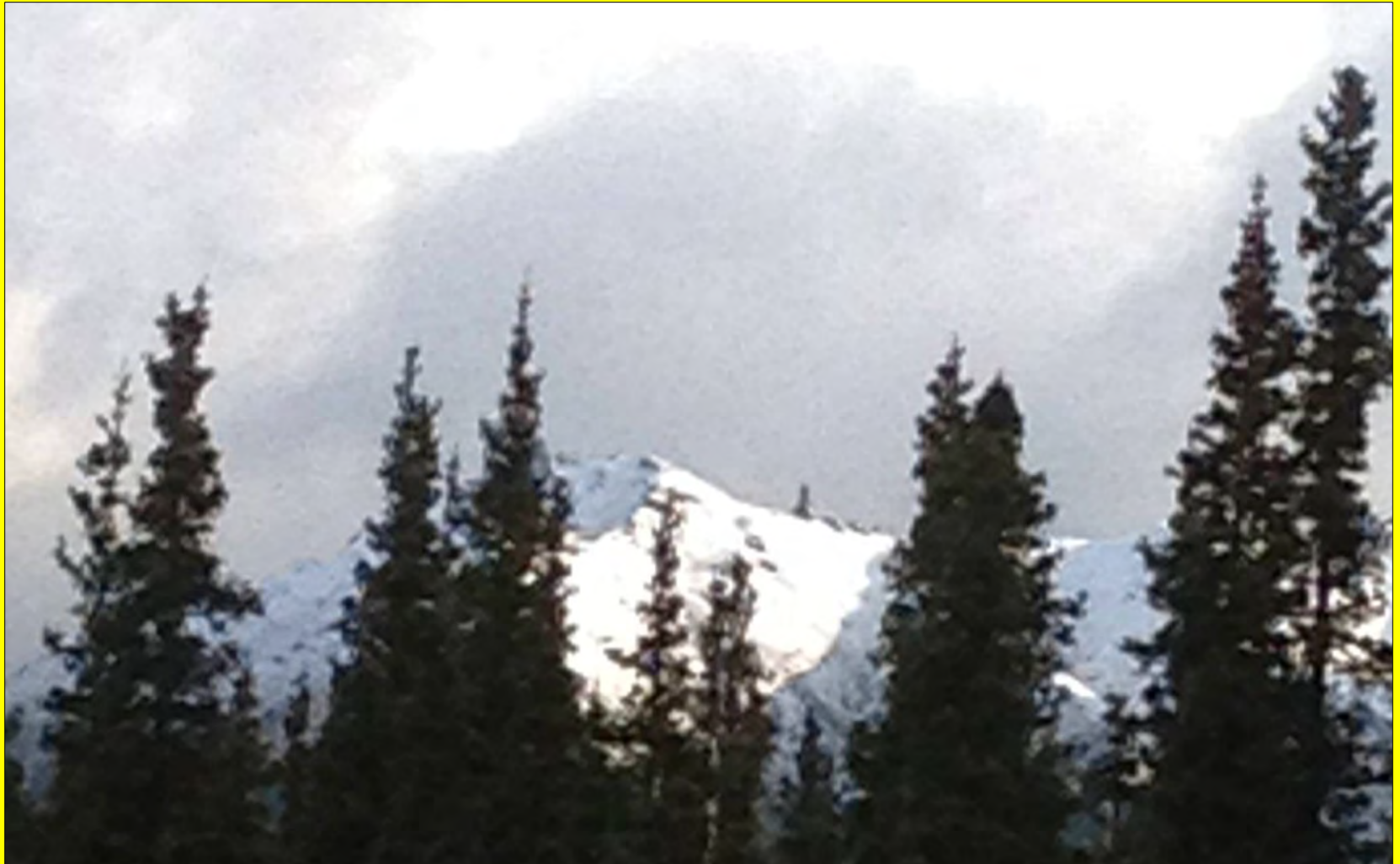
Musher Monument visible from back of cabins