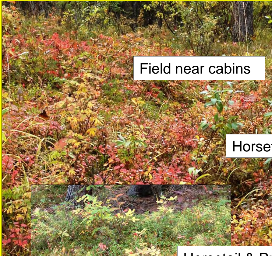
Field near cabins