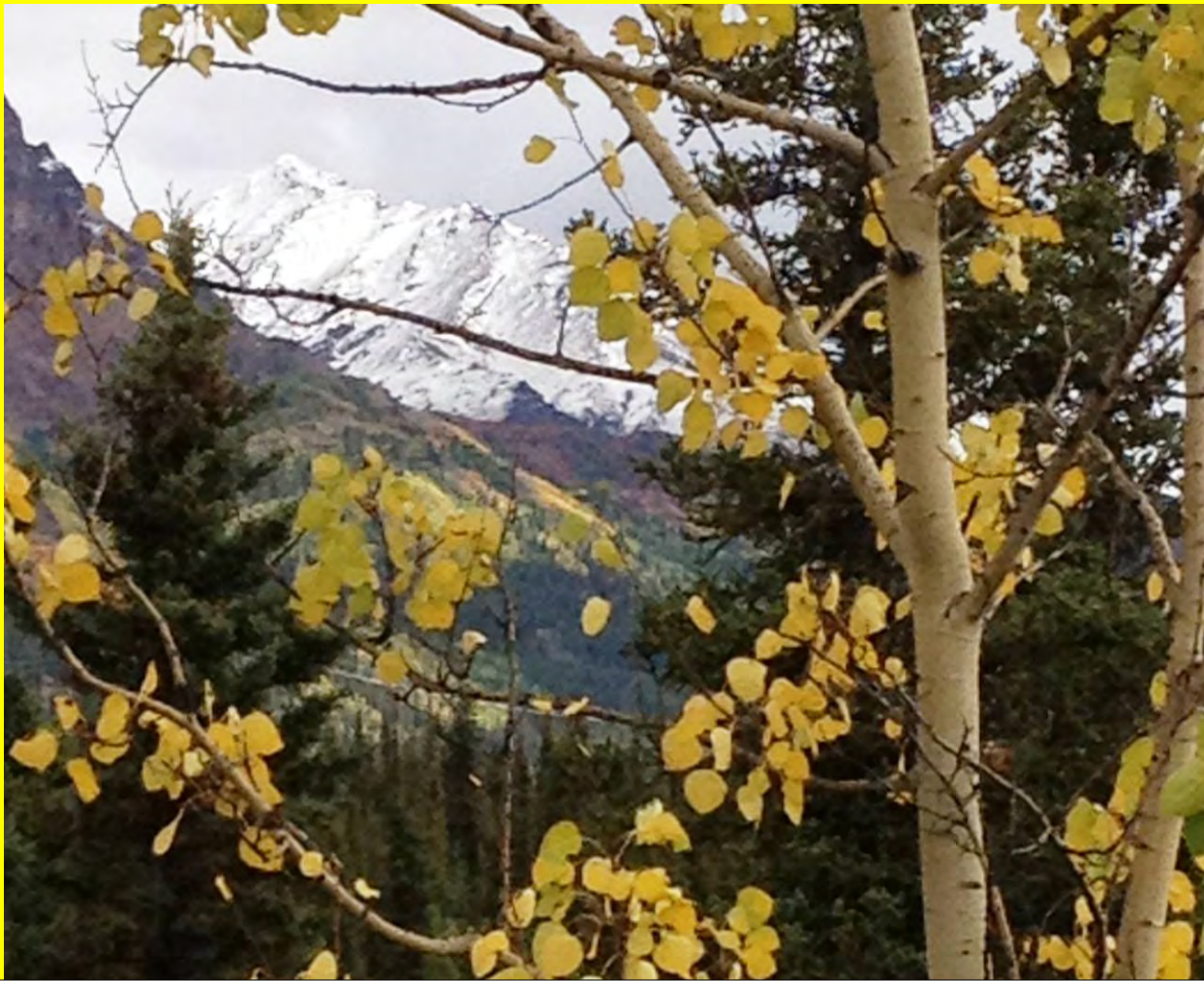
Mt. Fellows from Mile Post 234-Parks Hwy.