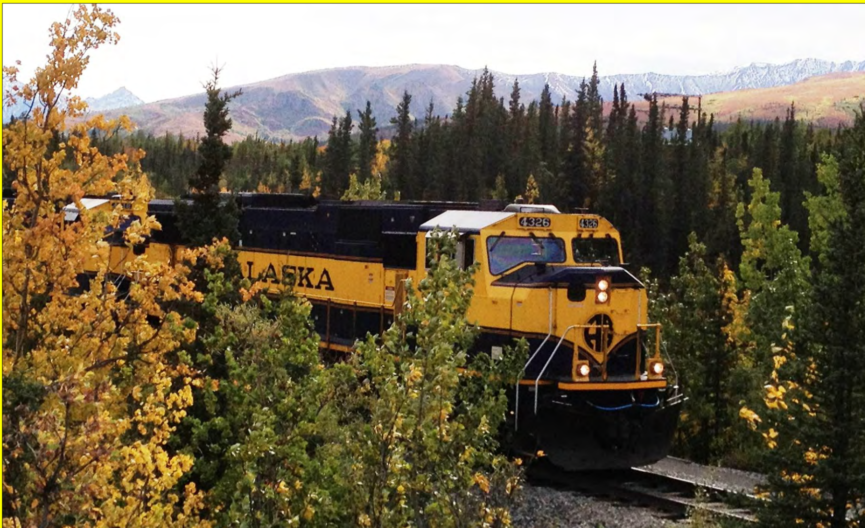
View of Alaska Railway from entrance to Horseshoe Lake Trail