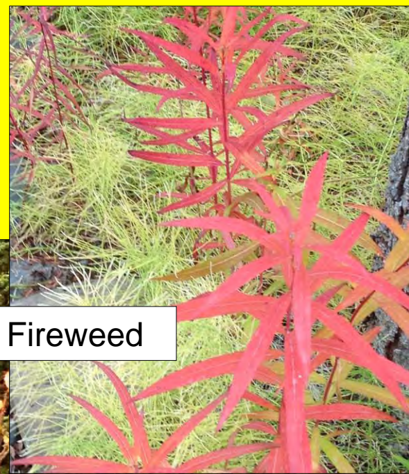
Horsetail & Fireweed