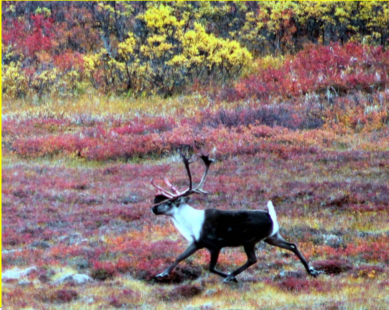
Caribou from bus along park road.