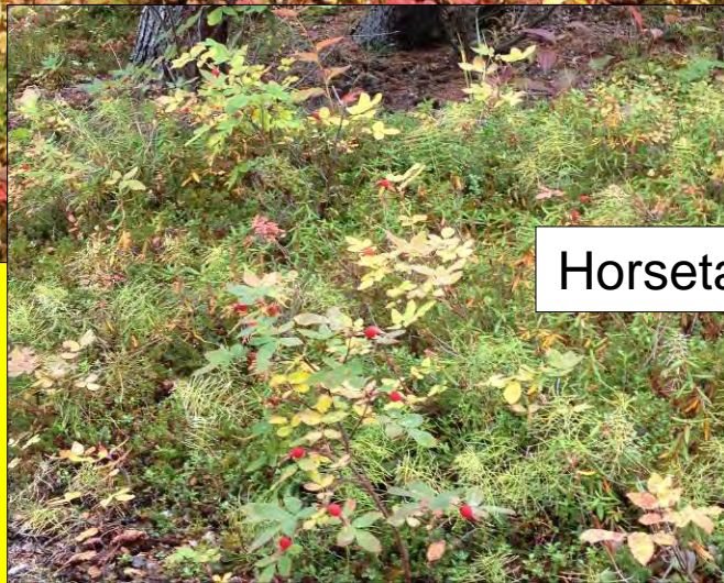
Horsetail & Prickly Rose