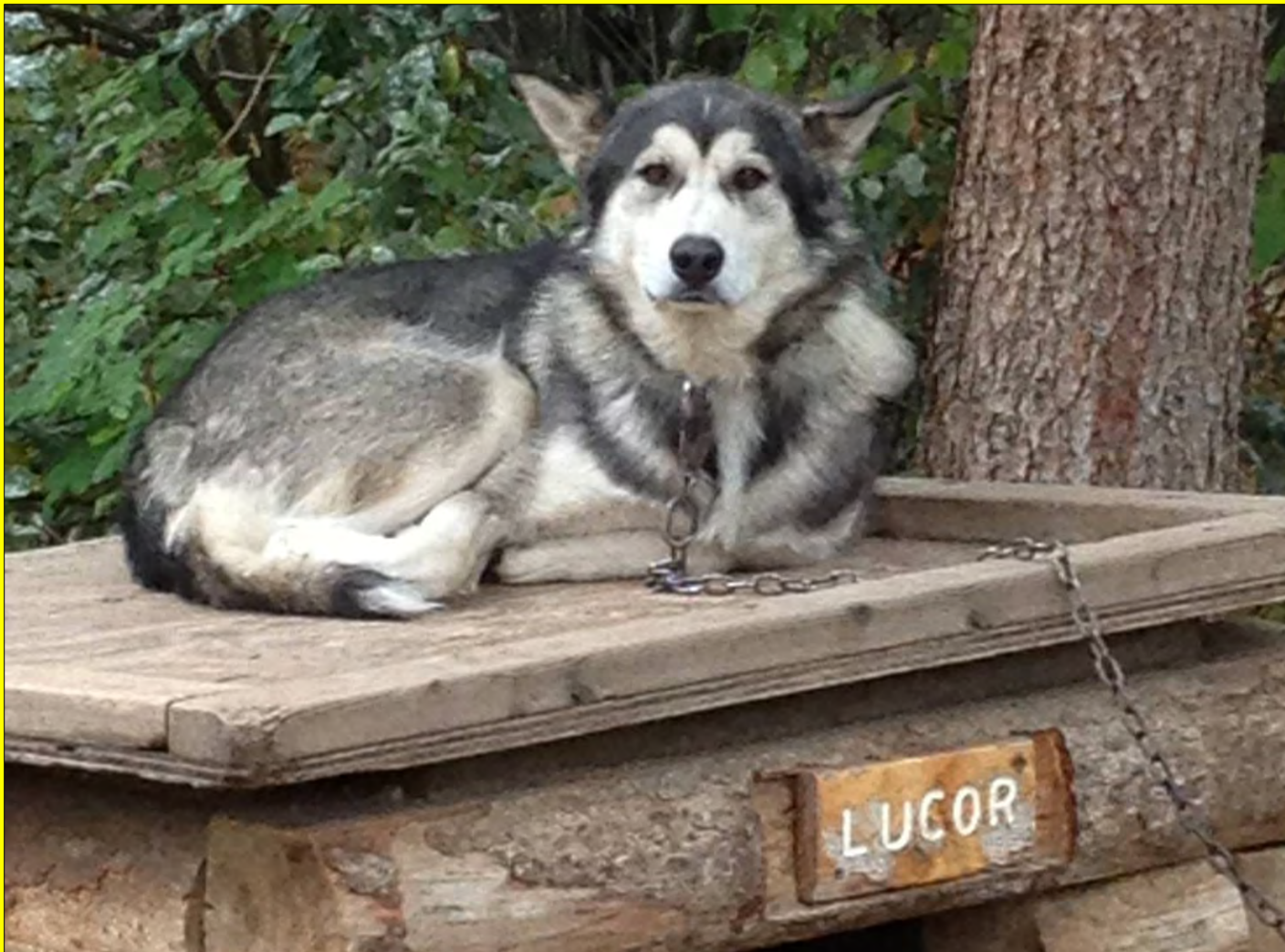
Lucor the sled dog – Denali National Park