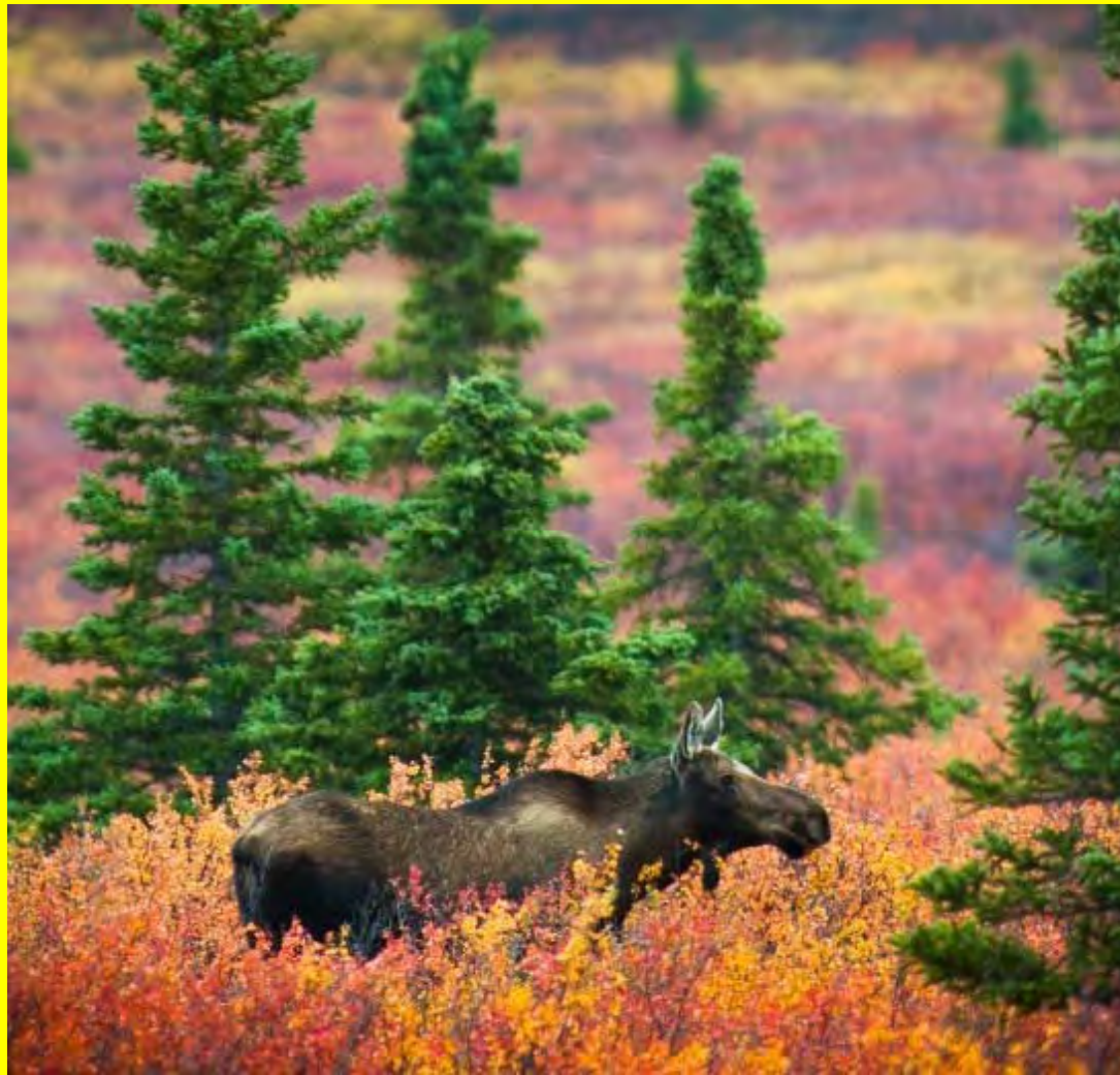
Moose from bus along park road.