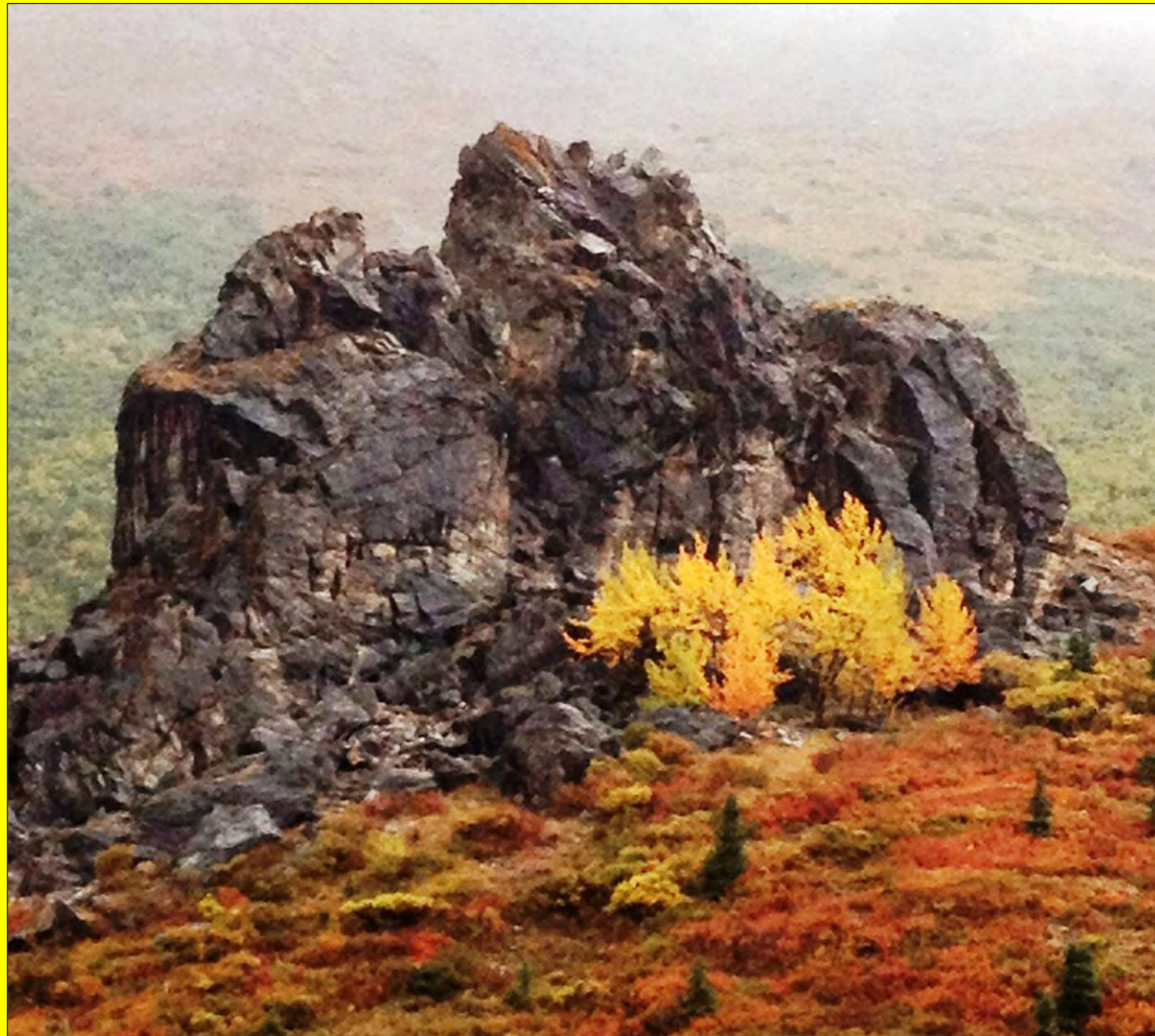
Rock near Savage River within Denali National Park.