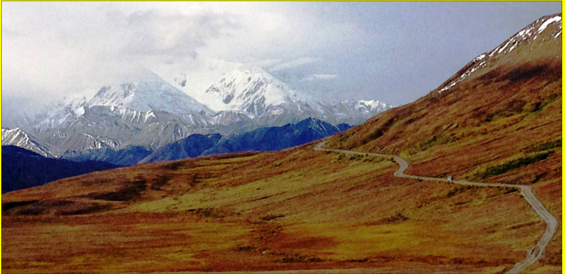
Mt. McKinley from park road.