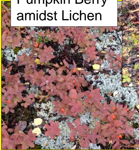
Pumpkin Berry amidst Lichen