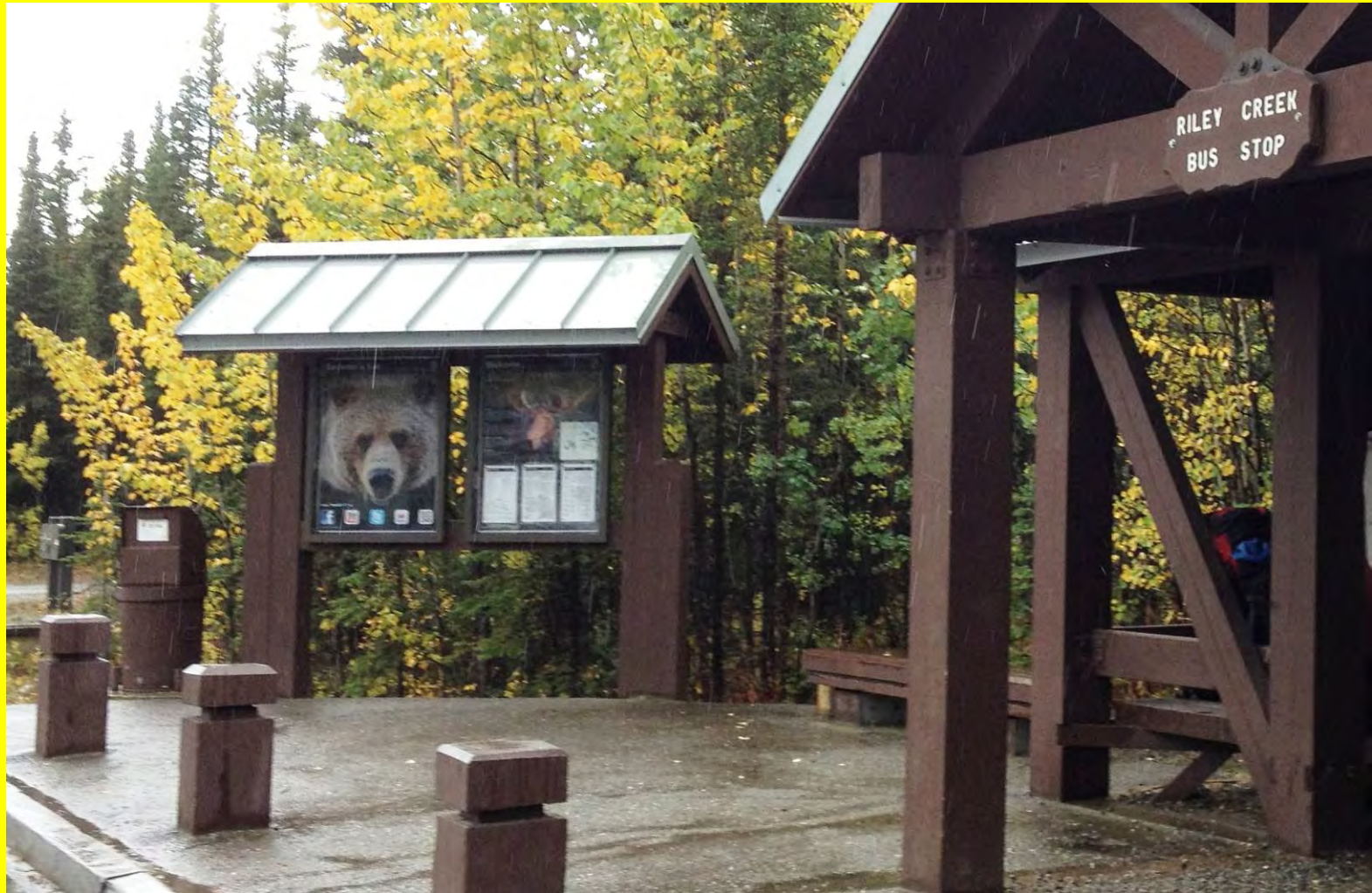
Riley Creek Bus stop