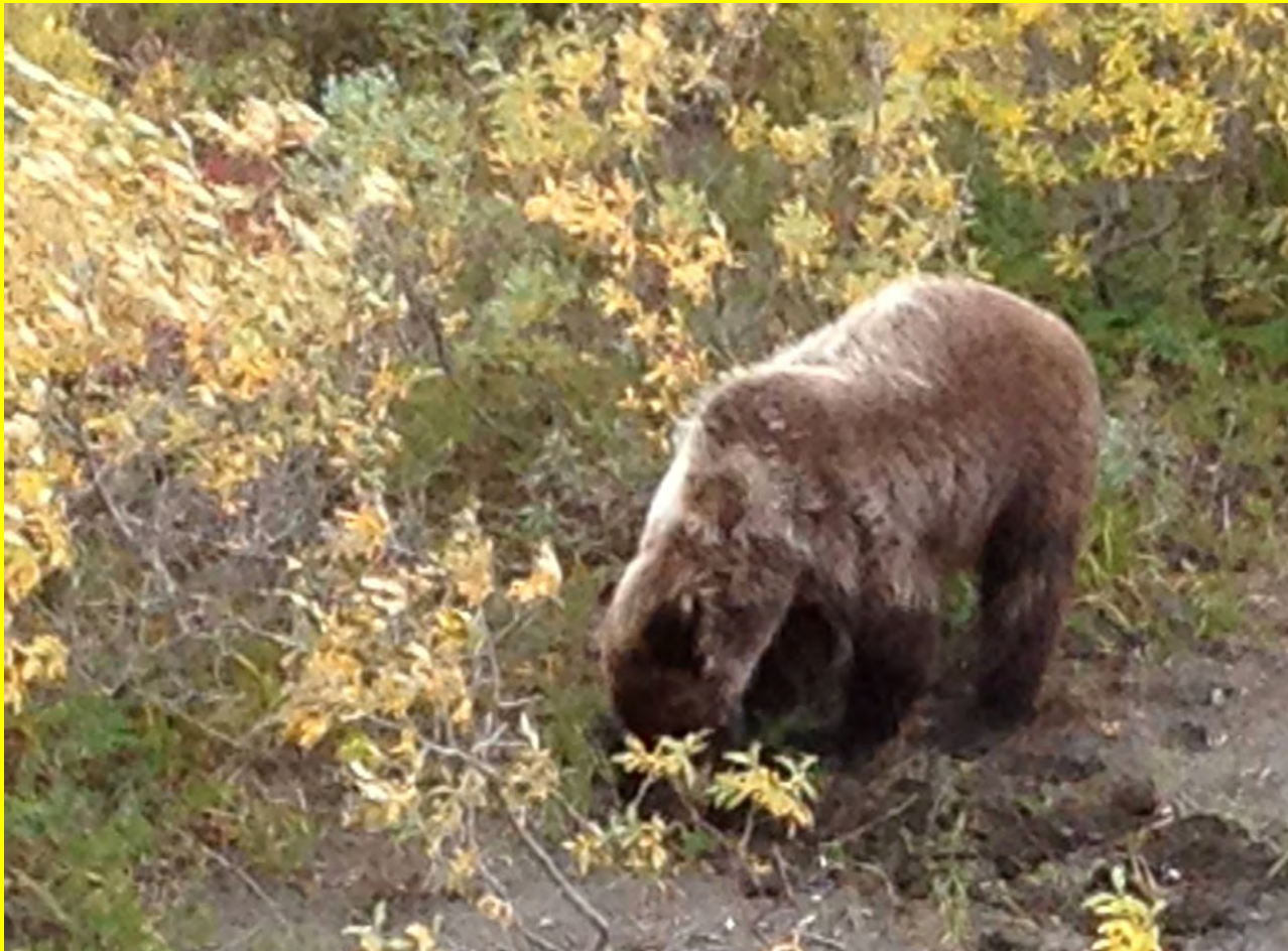
Grizzly from bus along park road.